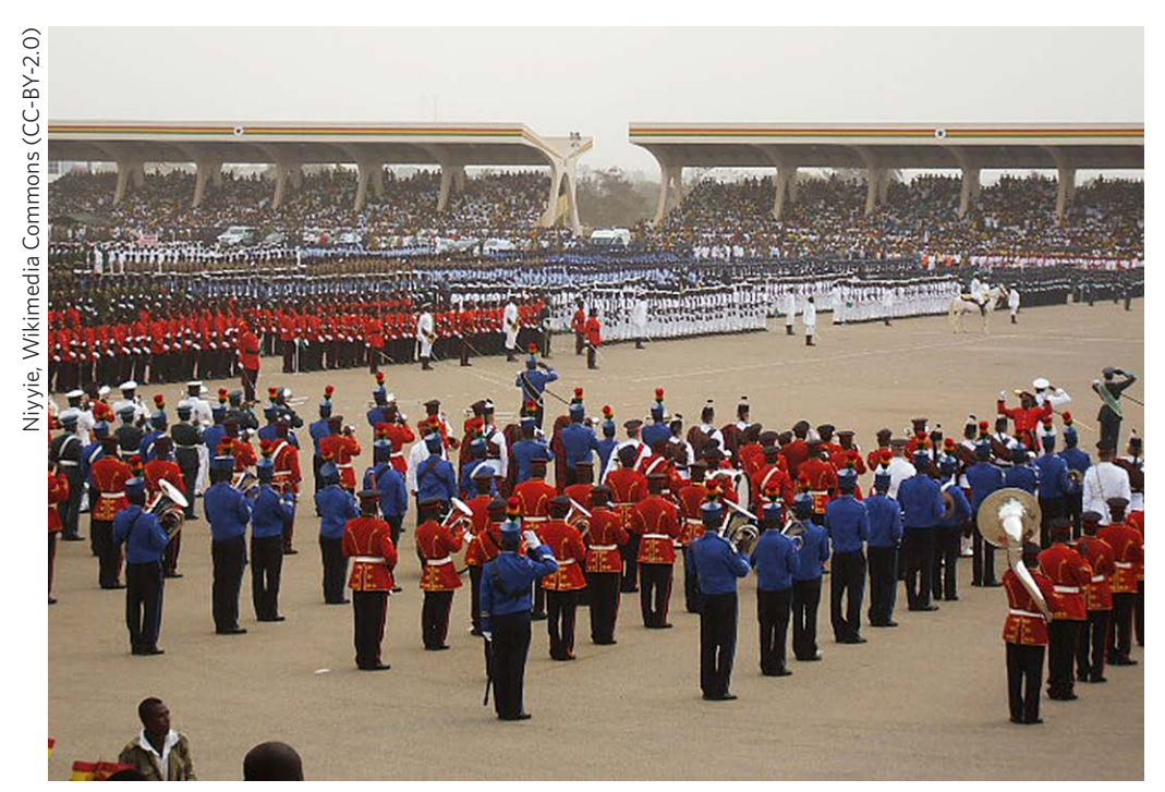
Figure 2. Independence Day celebrations at the state capital 7 March 2007. In addition to military parades, speeches and cultural displays, the libation performed by a local traditional priest has been a fixture of the festivities. It has been accompanied by Christian and Muslim prayers read by a chaplain and imam of Ghana Armed Forces.

all sectors of public life. Accordingly, traditional religion would be treated equally in relation to Christianity and Islam, which were the two 'world religions' practised in the country (see e.g. Nkrumah 1964).