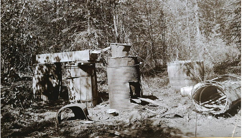
Hidden location for making illicit alcohol (Swe. lönnbränneri ) in Oravais in 1916, where magical healers ( omlagare ) were told to get alcohol.

textually unchanging opposition of stigmatized and stigmatizers (cf. Fairclough 1995: 60–1): it is the simple-minded rural population that consults magical healers, who merely con their customers, for example for financial benefit (e.g. Österbottniska Posten 25.7.1889; 31 Wasa Tidning 6.11.1896 32 ). In Österbotten (6.7.1867) magical healing and the establishment of elementary schools was directly confronted: ‘Many have been angered because the school costs a couple of pennies. But they are not so concerned for when a female witch fools them for several marks.’ 33 Financial arguments against elementary school were common not only in Swedish Ostrobothnia but in other regions in Finland as well. The costs of establishing and maintaining elementary