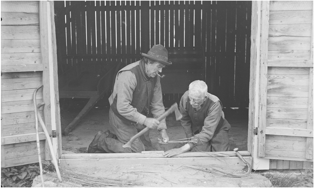
Healing illness knarrin in Ostrobothnia, 1915.

Vernacular beliefs were to some extent considered harmless as such, belonging to the mythic past in the pre-modern thinking that lifted up the Kalevala as one of the building blocks of the nationally shared heritage (Mikkola 2009: 222–3). When it came to healing, these beliefs hindered enlightenment with inappropriate health concepts. Stigmatizing discourses on magical healing labelled it as a superstition that was common even among people who considered themselves ‘God’s children’ ( Vasabladet 5.12.1895), which indicates that stigmatizing discourses about magical healing contained vocabulary familiar to revivalist movements. Labelling magical healing as ‘superstition’ portrays it as something that good Christians do not engage in, that is, as ‘false beliefs’ (Swe. wantro ) that are ‘without a doubt a heritage from the darkness of paganism’ 15 ( Österbottniska Posten 28.6.1913).