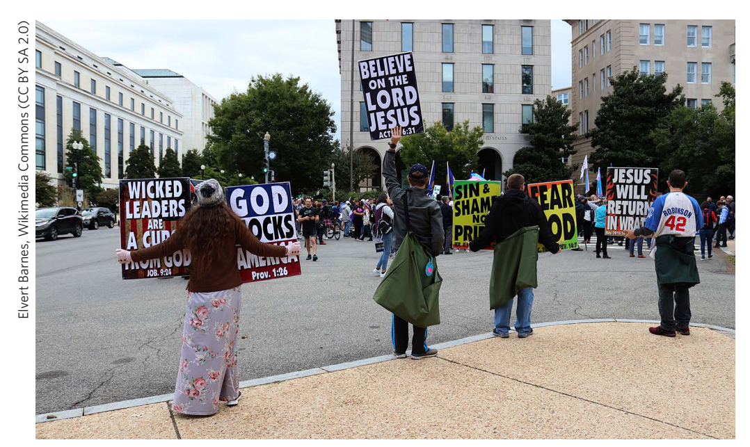
Figure 1. Westboro Baptist Church picketing a LGBTQ Workers Rights Protest in Washington, DC; October 2019.

world-wide scale through their practice of picketing funerals of dead soldiers and their vocal anti-LGBTQ rhetoric (Barrett-Fox 2016). Through this stance, coupled with their preaching, which accuses Jews of deicide in being responsible for the death of Jesus – a historically recurring trope of antisemitism<sup>7</sup> - the Westboro Baptist Church has been labelled a hate group. This position can be seen, for example, on an information page of the Southern Poverty Law Center webpage, describing the church as 'arguably the most obnoxious and rabid hate group in America'. Interestingly, and perhaps at first glance somewhat paradoxically, the late Phelps Sr was, for a significant part of his life, a practising lawyer, specializing in civil-rights cases and discrimination against persons of colour. While Phelps's legal career seems to have