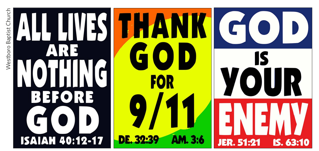
Figures 3, 4 and 5.

Barrett-Fox 2016: 83-4), they seem now to have consolidated it all on their main hub <www.godhatesfags.com>, making The Internet Archives' Wayback Machine a necessary tool for historical research. Among these discontinued sites we can find <www. beastobama.com>, promoting the idea that the former US president is the Antichrist, <sup>13</sup> and <www.godhatessweden.com>. This latter example focuses the group's ire against Sweden for having indicted a Pentecostal pastor for preaching against homosexuality - labelling the King of Sweden an 'analcopulator', and a 'King of Sodomite Whores' (2005a); it also thanks God for the 2004 Boxing Day tsunami: 'Unconfirmed numbers of Swedes are dead as a result of the tsunamis which ravaged Thailand and the other lush resorts of that region, and thousands more are unaccounted for, either still