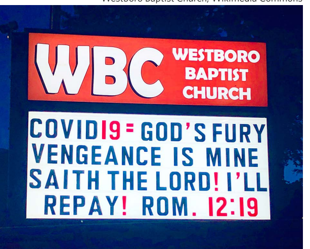
Figure 8. Westboro Baptist Church sign commenting on COVID-19.

Westboro Baptist Church, Wikimedia Commons