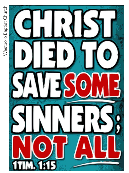
Figure 2 . Westboro Baptist Church sign drawing upon the notion of limited atonement.

Through the five points of Calvinism, humanity is seen as by itself to be irredeemably sinful: 'Every human being was born in sin and is inclined to sin per Adam's curse; it is a part of our very nature and the reason why we need a Savior!' (Westboro Baptist Church 2020k). Being predestinarians, through the idea of the unconditional election, God is seen as having elected those destined for heaven before the creation itself. Coupled with this is the notion of the limited atonement, that Christ's sacrifice only atones for the sins of the elect (see Figure 2). Further, the status of being among the elect is seen as being effected by the grace of God in an infallible manner. The divinity chooses who are to be saved, and the elect can never be lost12 (Barrett-