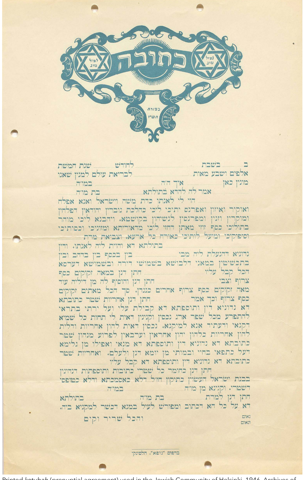
Printed ketubah (prenuptial agreement) used in the Jewish Community of Helsinki, 1946. Archives of the Jewish Community of Helsinki, Finnish Jewish Archives, National Archives of Finland.