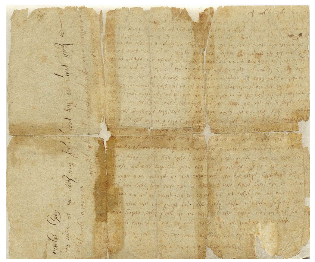
A Yiddish letter concerning matchmaking, 1874.

is shown by Fig. 1, the tradition of matchmaking ( shiddukh )<sup>15</sup> was also practised in the community (NA Muu).