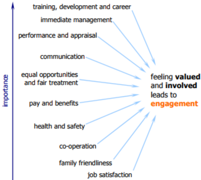
Figure 2. Engagement driving factors (Robinson, 2007a, p. 3)

Considering the degree on how important these driving factors influence the employee engagement, Institution for Employment Studies (IES) conducted a survey in 2003. The order of the factors can be seen from Figure 2.