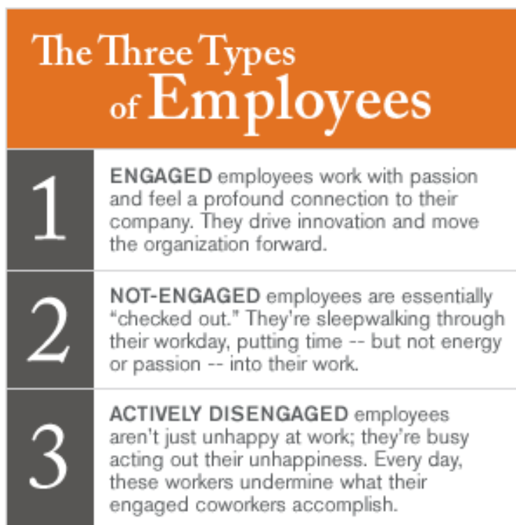
Figure 3. Three types of employees (Krueger & Killham, 2006)

There are three types of employees which can make an influence on the organizational business outcome, as can be seen in Figure 3. The optimal scenario for every organization is to increase the number of highly engaged employees and maximize the benefits of employee engagement as much as possible.