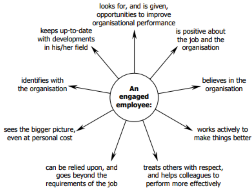
Figure 4. Characteristics of an engaged employee (Robinson, Perryman & Hayday, 2004, p. 6)

Employee engagement helps organization develop better in the performance field, from the process to the outcome. The actions and performance of the engaged employees can affect the organization in a positive way. They are the one who believe in the organization, keep developing themselves to make things better, identify with the organization, can be relied upon when things get hard and see the organization's importance the same way as they see themselves. In the report about employee engagement in 2010, during the economic challenge times, the organizations with high levels of engagement of sixty-five percent or higher "outperformed the total stock market index and posted total shareholder returns that were twenty-two percent higher than average. On the other hand, the organizations with low engagement (forty-five percent or less) had a total shareholder return that was twenty-eight percent below average". (MacPherson, 2013, p. 3) Consequently, employee engagement therefore not only helps the organization in achieving the best outcomes in business, but also retains the best place to work and increases the employee retention level.