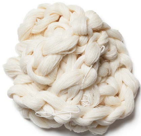
Fig. 7. The beginning; the warp.