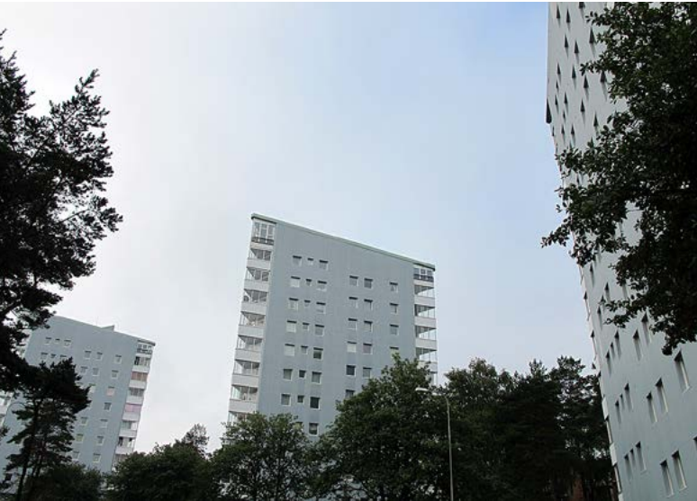
Fig. 12. Kortedala architecture.

At the very same time as this article is being written I am preparing for a clinical study, which is planned to be conducted in three Swedish delivery wards, and where the application is to be handed in for ethical vetting. The path has been a long one – from the first thread to be chosen until now, when it is time for the textile to be tested in practice, in action.