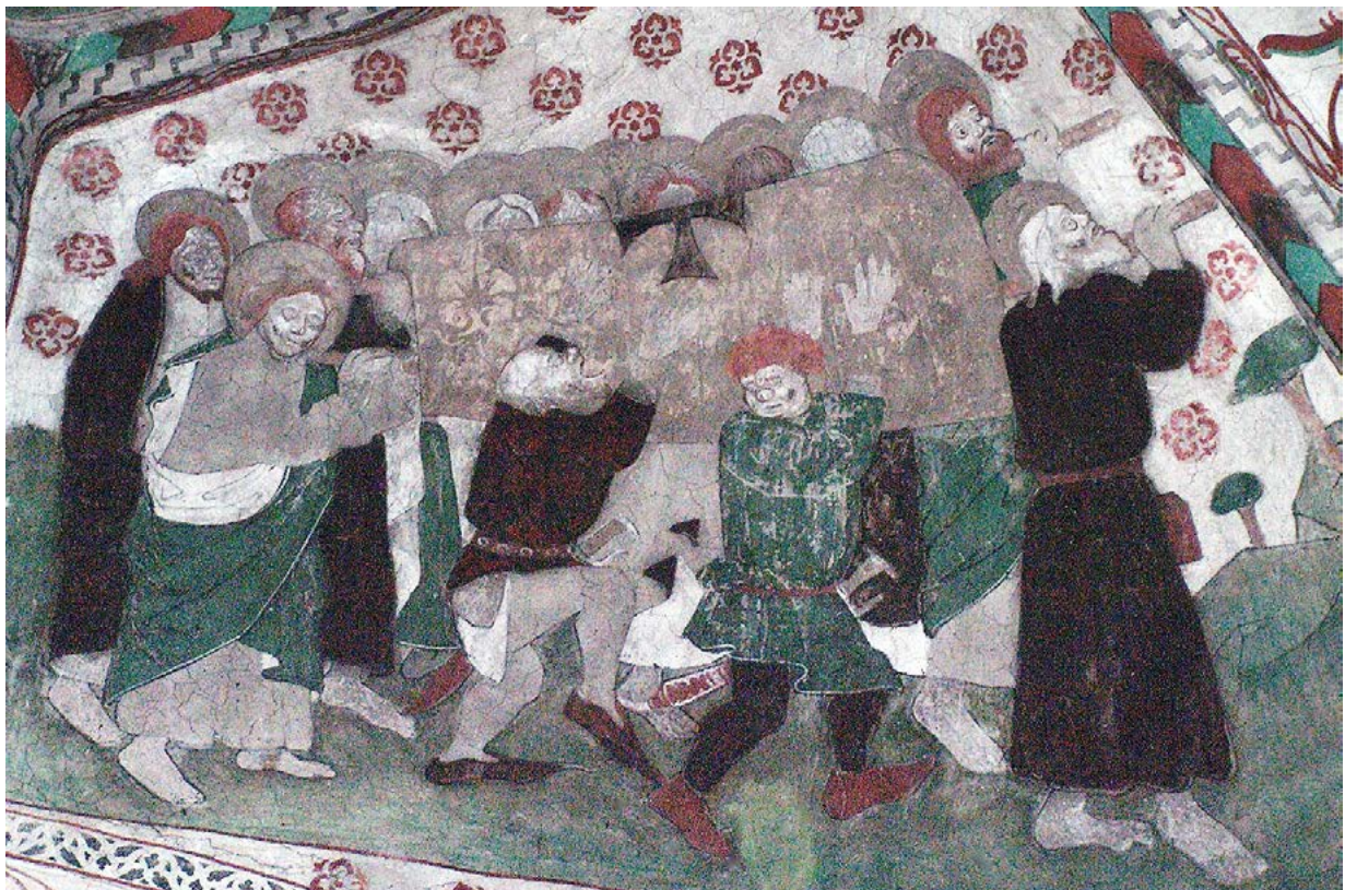
Fig. 2. Medieval church painting by Albertus Pictor in Kumla Church.

The funeral pall as a part of Swedish funeral rituals has medieval roots; however, its function and use, as well as what it is an expression of in contemporary times, are really quite different from what they were in the past. We have very few of these textile objects, if any, remaining today. However, there are a number of descriptions painted on the walls of churches that can still be found (Fig. 2). What we see