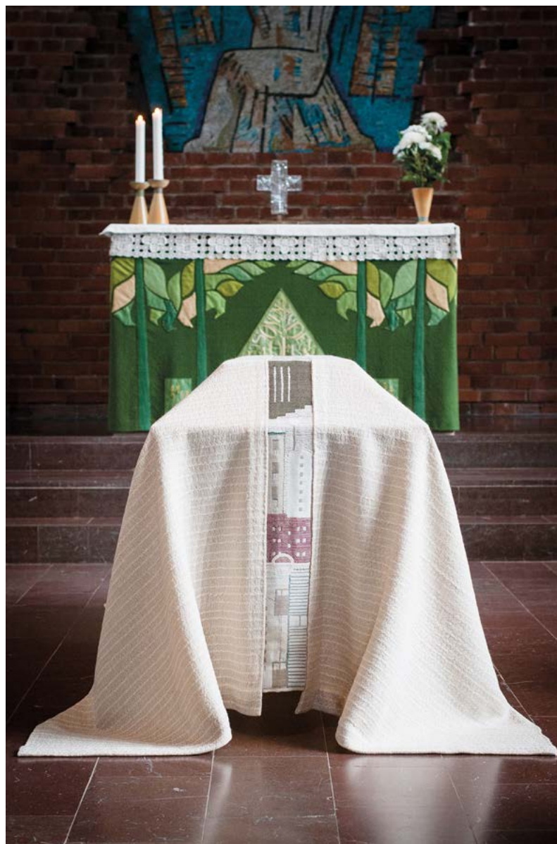
Fig. 15 (top). Detail of process. Fig. 16 (bottom). 'The Chronicle of Kortedala'.