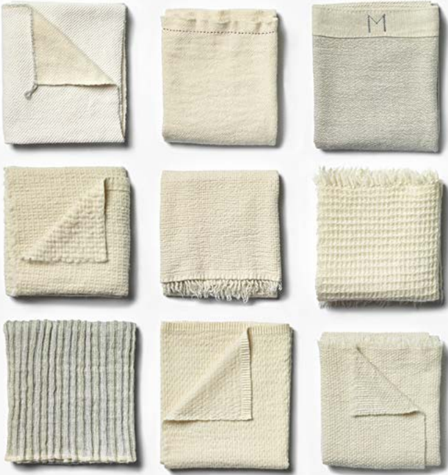
Fig. 6. Infant-wrapping cloth, handwoven, 2011.

of metaphors related to weaving. The prophet Isaiah wrote about death in the following way: