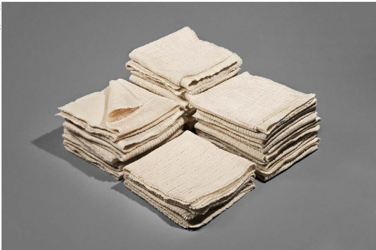
Fig. 17. I sin linda . Swaddling blankets 2015.