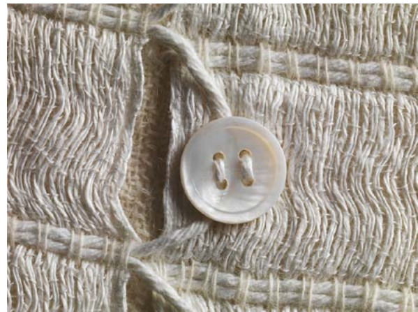
Fig. 5. Detail of the button blanket.

this: ‘I wish you could weave smaller blankets for me. When we lose a child, I never know what to say to the parents. With a blanket in my hand, I could say: “You may wrap your baby in this”’.