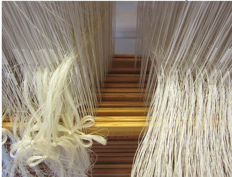
Fig. 8 (left). Pulling on the warp with weights. Fig. 9 (right). Hedding.

But we never dress the ordinary table. In English the expression ‘dress’ is connected to a variety of actions related to setting up, processing and preparation. It has constructive elements. So here it is appropriate to mention that the title for this paper: ‘Dressing the body’ is chosen using the word ‘dress’ in its widest sense and meaning.