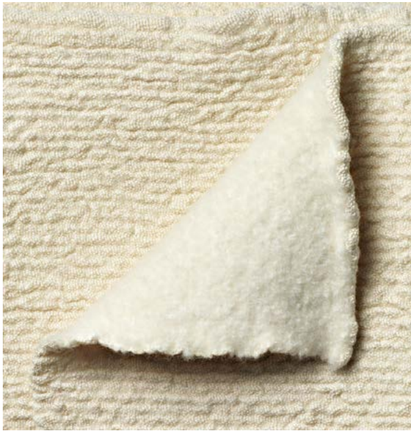
Fig. 1. Detail of an infant-wrapping cloth, handwoven, material silk and wool, 2011.

funeral palls that originally inspired me to create these smaller blankets. Reflecting on the textile gestures and actions that arise when these different kinds of blankets are created and used is also an integral