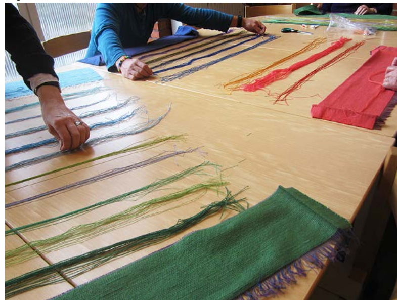
Fig. 13. Unravelling and ordering.

Here I spent a summer sketching and taking photographs of places that I had been recommended to visit by church members. They sent me letters with instructions and I went out ‘collecting’ for the weave