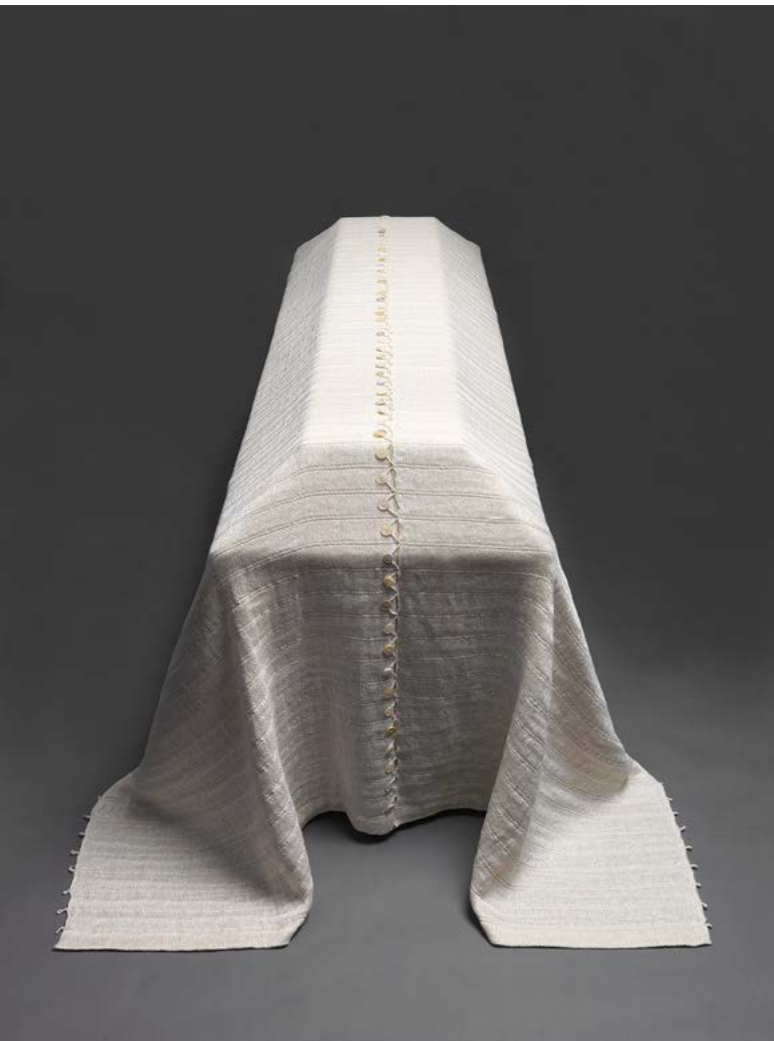
Fig. 4. The button blanket, 2008.