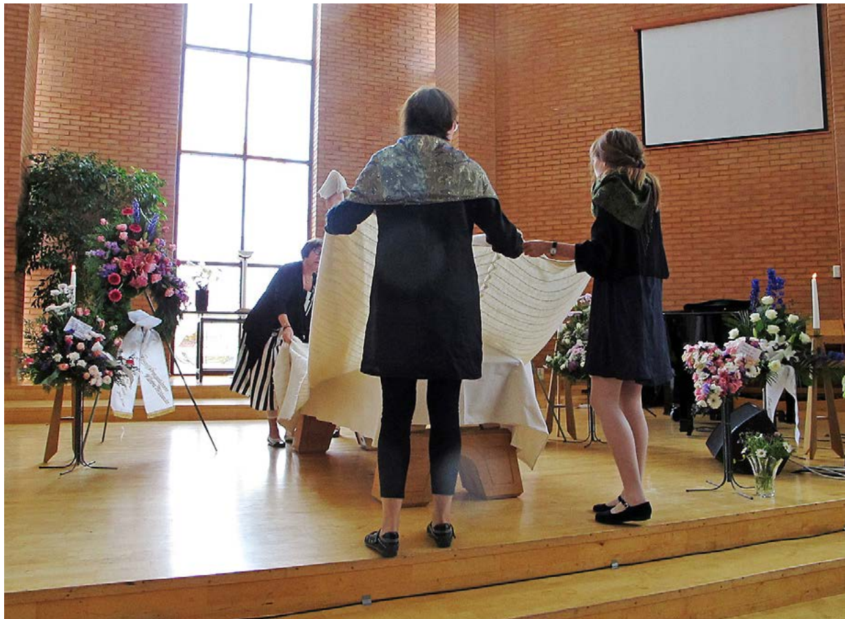
Fig. 3. Dressing the coffin, 2014.