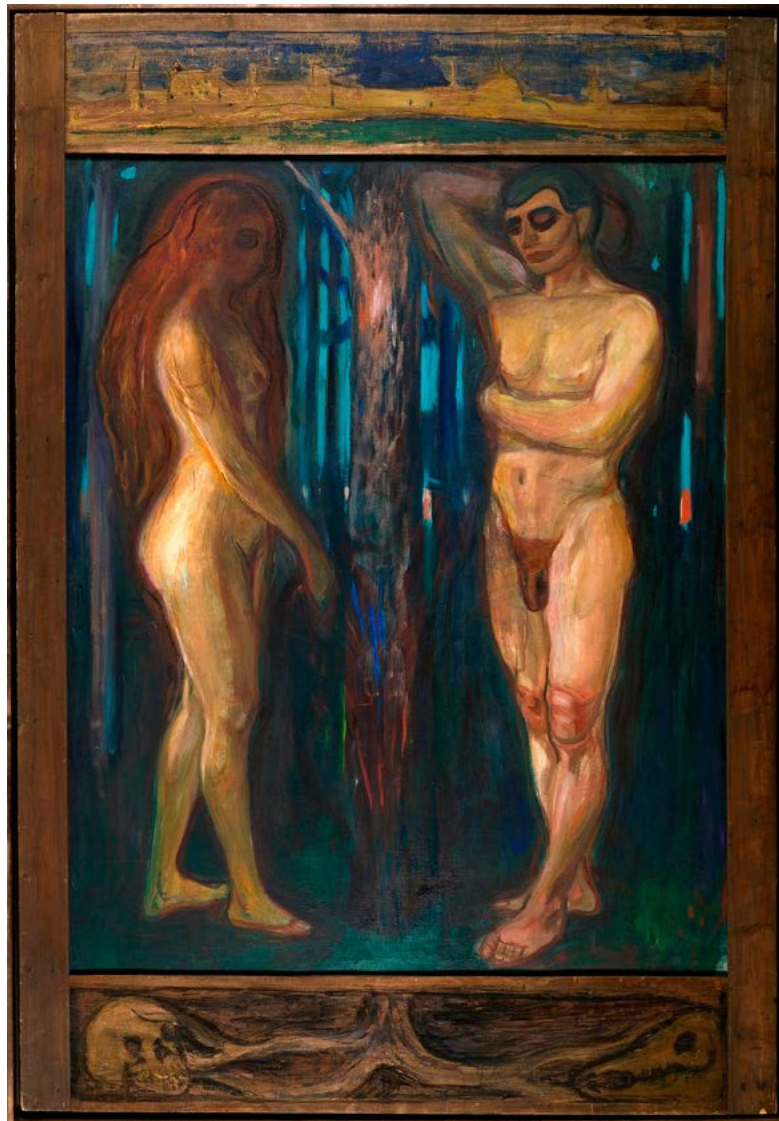
Edvard Munch, Metabolism (1898–9), oil on canvas.

century when Munch developed the motifs for his Frieze of Life . Although Munch came from a religious family and was familiar with the traditions of religious imagery, he was also interested in the questions of science. Munch was well acquainted with a number of people who had been educated in the natural sciences. For example, his father and brother were both doctors and his friend Stanislaw Przybyszewski (1868–1927), a Polish author, had studied physiology. At the turn of the nineteenth and twentieth centuries both of these artists lived and worked in Berlin. In Berlin Przybyszewski played an active role in introducing ideas from the natural sciences into the artistic and literary circle known as Zum Schwartzten Ferkel . Particularly, the idea of evolution captured Munch's artistic imagination, as can