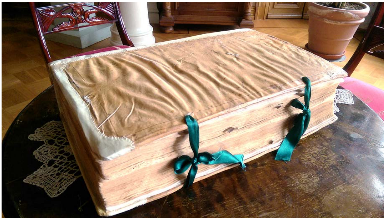
The Turku copy of the Mercator-Hondius Atlas at the Donner Institute.