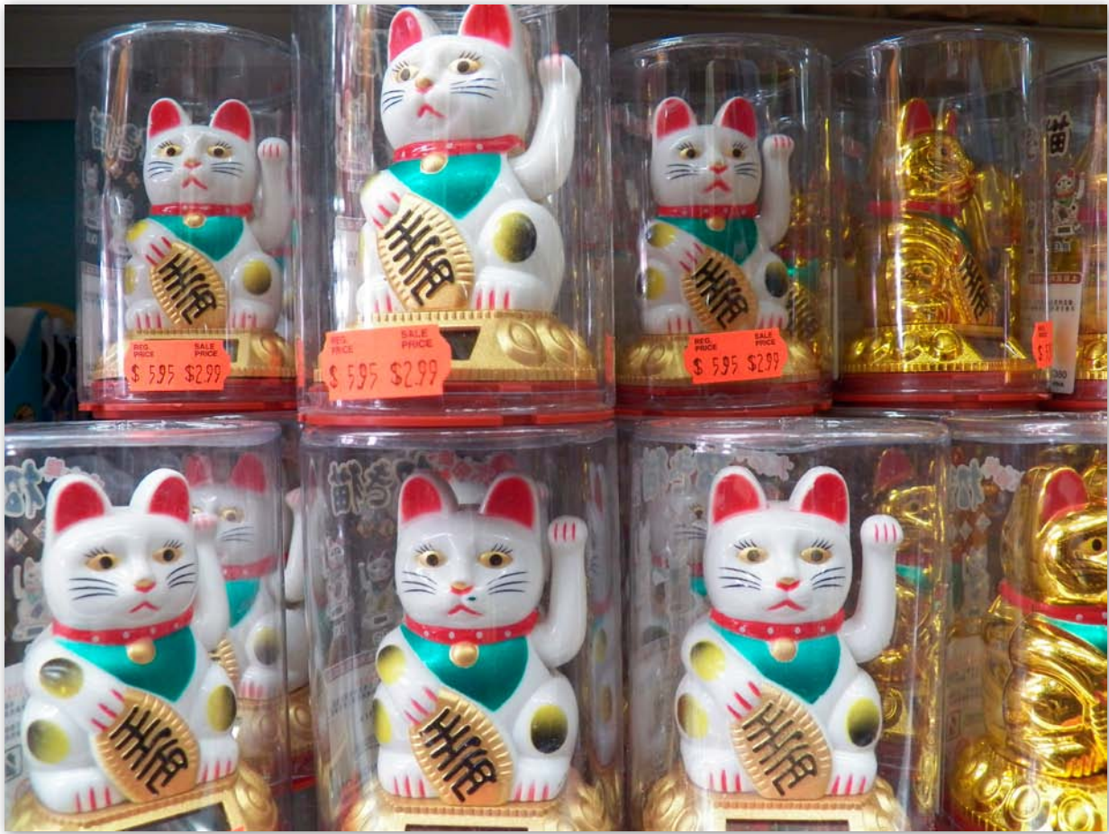
Chinese shop, San Francisco. Any object can be an Ethnic Marker. Not the price, material, shape, or use matter, but the feelings attached to the object.