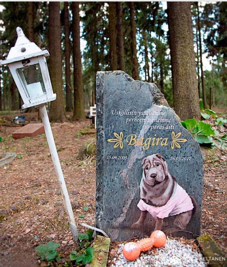
Helsinki pet cemetery.

– excavating this place in 3000 AD. Would s/he be able to retrieve Finnish ethnicity from the material remains?