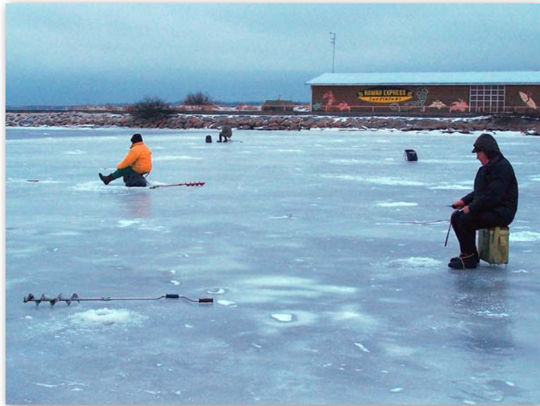
Ethnic groups most likely existed in Prehistory, but we cannot fish them out, since we have no written clues. Ice fishing, Pirita River, Estonia.