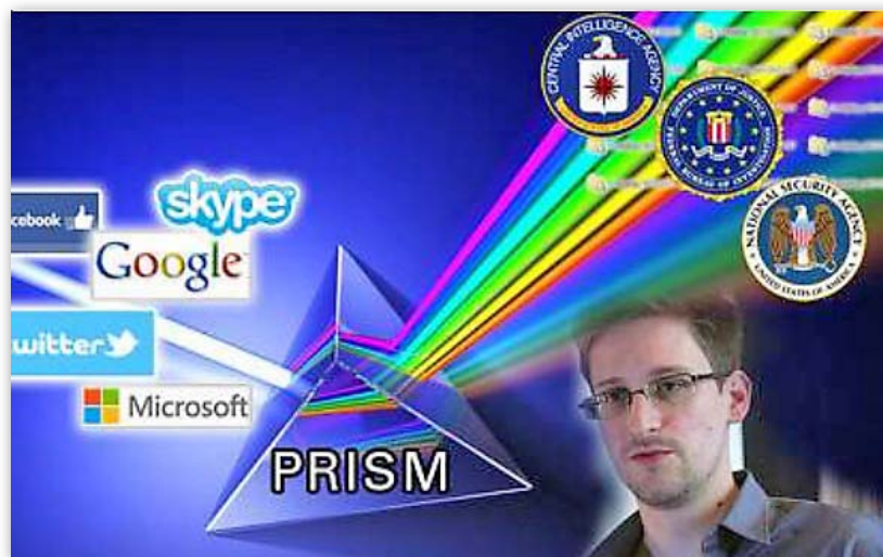
Understanding new media: the extensions of the state.

In short, the form of the new media of the mobile telephone in particular matters because it is instigating new forms of socio-cultural collapse . Moreover, these new forms of socio-cultural disintegration not only abolish our sense of place but also our sense of privacy, as unexpected consequences, such as the recently revealed evidence of the telephone hacking