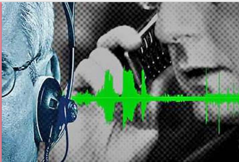
Left: The telephone has unforeseen consequences: the call-girl. Right: American intelligence: the telephone as a form of covert shared participation.

A further claim of McLuhan's concerns the telephone as a form of shared participation within the small town, specifically in the initial era of the commercial telephone in the early twentieth century. He signals the small town as a key issue, as the 'back fence' is substituted for the 'heated participation of the party line' (1994: 268), which reminds us that, once upon a time, the telephone was a new media machine used more for amusement than for the state or for commerce. These and McLuhan's subsequent claims about the telephone rendering speech visible and uniting electronic technology with the domain of speech and language from the dawn of the age of electricity reveal deep connections between the mass media of the spoken word and electronic technology, the first and second great extensions of our central nervous system, and other, perhaps more threatening, telephonic alignments in the contemporary form and character of the telephone, such as wiretapping.