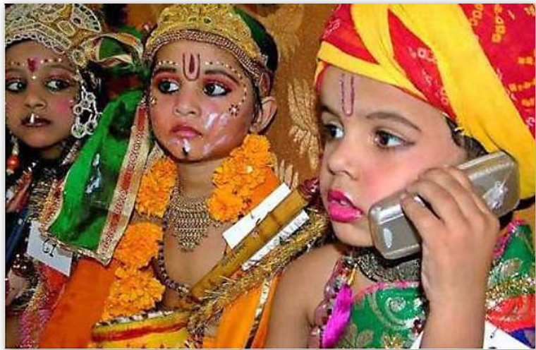
The new form of the telephone is shared in the global village.

Rendering speech visible to the US state and to big business thus presently entails the invention of another new media machine, the US National Security Agency's (NSA) new media machine, which clandestinely gathers the location, telephonic speech, and recorded language of tens of millions of Americans on electronic technology. The new telephonic alignments and the technological convergence of the realm of speech and language today therefore expose the extensive electronic interconnections between telecommunications companies, such as Verizon, and the electronic technology of the US state, given that Verizon was directed by a secret court order to hand over all of its telephone data on a continuing, daily basis to the NSA. Perhaps in the late twenty-first century, then, this third great extension of our central nervous system will threaten even non-telephonic arrangements in its future form and character, as the telephonic imaginary moves beyond wiretapping and internet server tapping to Wi-Fi tracking small-town,