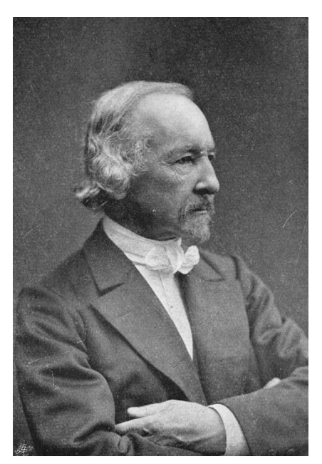
Zacharias Topelius, 19th century.

Tengström was writing in the early nineteenth century, approximately 30 years after the French revolution, but still much later on this same idea of the French Enlightenment as a cautionary example keeps coming up in the Finnish context. One example could be Zacharias Topelius (1818–98), a journalist, novelist and historian (still writing actively in the 1870s and 1880s), for whom the eighteenth century appeared as an era not of progress but decline. At a general level criticism was also directed towards the skeptical tone of the era, one important aspect